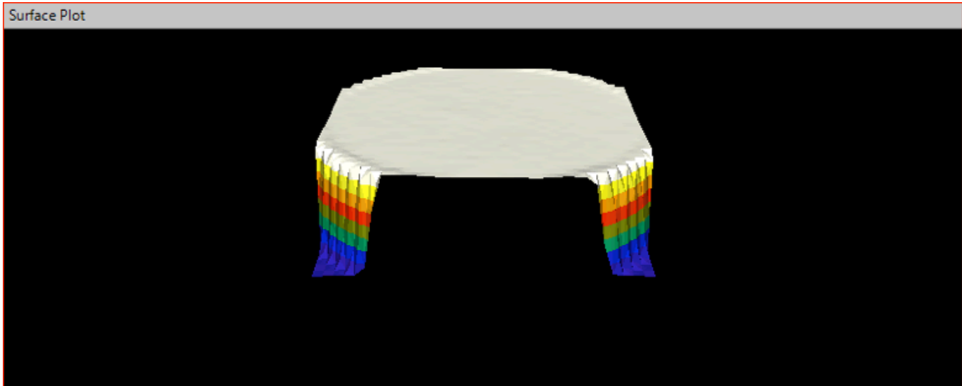
Luminance Uniformity Chart of Typical ALS